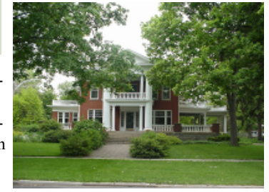
Historic Home in St. Johns

Residential - The City of St. Johns features many different types of residential living, from new subdivisions to historic older homes. There are a number of apartment and condominium developments offering a variety of amenities. Local homebuilders are ready to serve your construction needs, as well as landscape, design firms and businesses that specialize in home improvements and home furnishings.