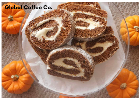
Global Coffee Co.

VISIT: Nina's Notions Paper Crafting on Facebook to register today!